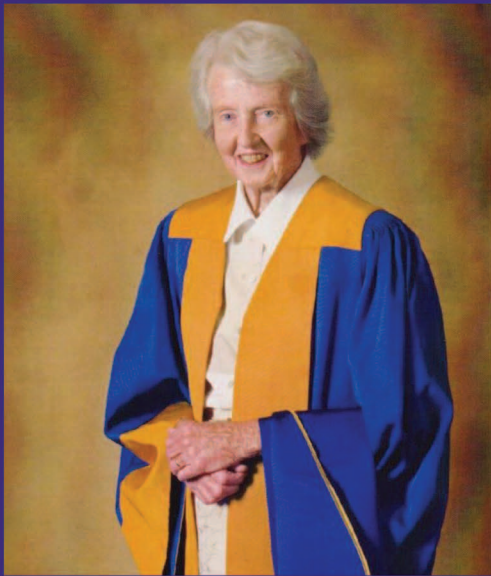
Caird Hall • University of Dundee July 2006